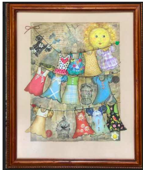
Collage and Mixed Media